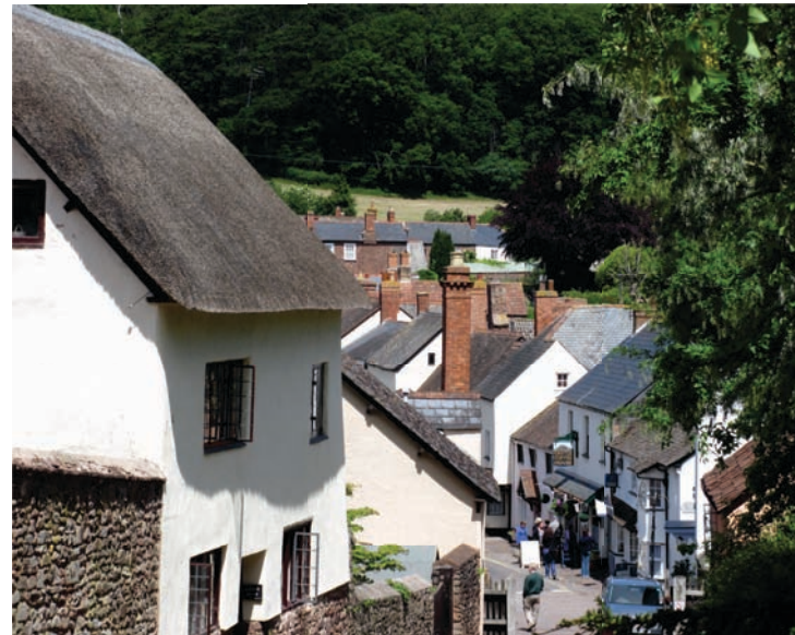
(above and below) Buildings abutting the highway with no visible curtilage. Elevations that work with changing ground-levels and relate to a small scale.

Examples of the characteristics that reinforce character and local identity and provide models that could be referenced in future development.