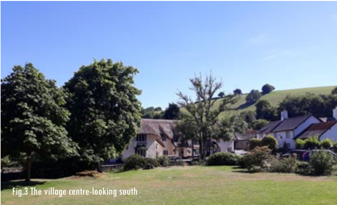
Fig.3 The village centre-looking south

In the centre of the village there is an irregular sequence of cottages, sometimes facing each other across the street, or set at angles to the highway. These varying alignments along narrow curving lanes provide much of the inherent historic character. Within this close-knit pattern, several centuries of building are represented and there are variations of scale, style and gradual change of function. The village green and the road layout form a very open core to the village with outward views to the wooded hills to the south and open fields to the north.