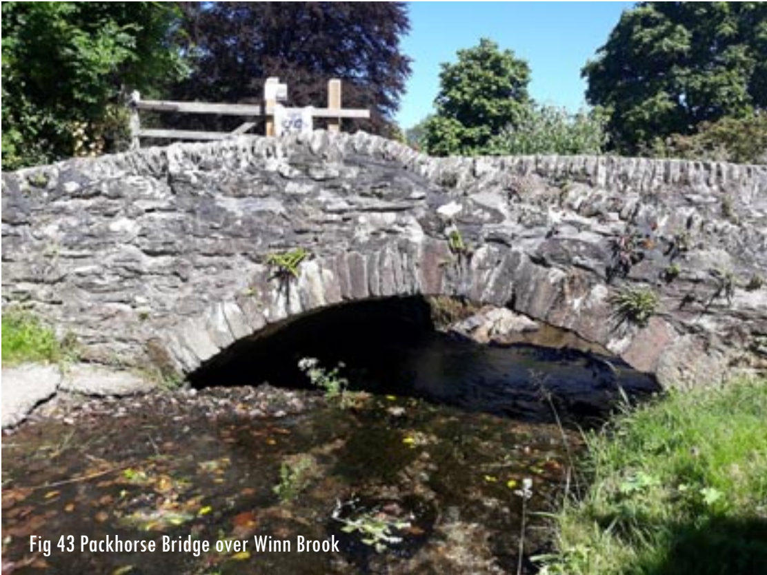
Fig 43 Packhorse Bridge over Winn Brook