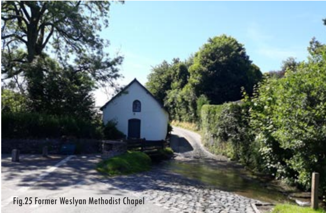
Fig.25 Former Wesleyan Methodist Chapel

Another detached cottage is Sunnymead , originally 17th century but extended and re-fronted in the early 20th century. Probably originally a three cell and cross-passage plan, but since altered internally. Rendered over rubble and possibly some cob, there are three rendered stacks. The below eaves first floor windows indicate a former thatched roof with swept eaves, and there is an early 19th century iron-frame casement window with leaded-lights. The listing details mention that this cottage is "principally listed for its contribution to the picturesque village scene, overlooking village green."