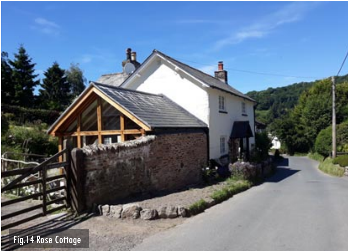
Fig.14 Rose Cottage

Almost opposite, Rose Cottage is 19th century or earlier and has a late 19th century porch and a recent side extension with a timber framed, glazed gable end.