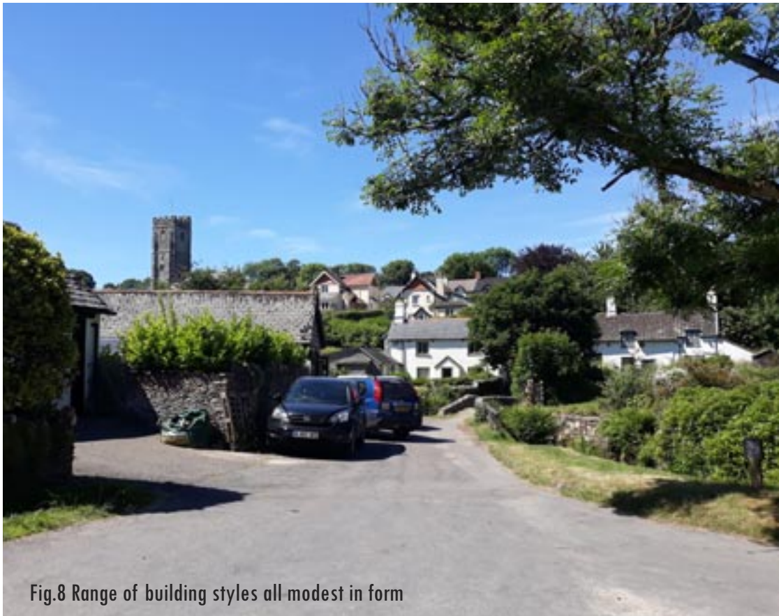
Fig.8 Range of building styles all modest in form

Other late 20th-century houses are larger and do not closely follow the prevailing vernacular tradition in terms of scale, plan-form and position in the plot. The largest houses are, unsurprisingly, those with formerly the highest status, The Old Vicarage, the Royal Oak and Karslake