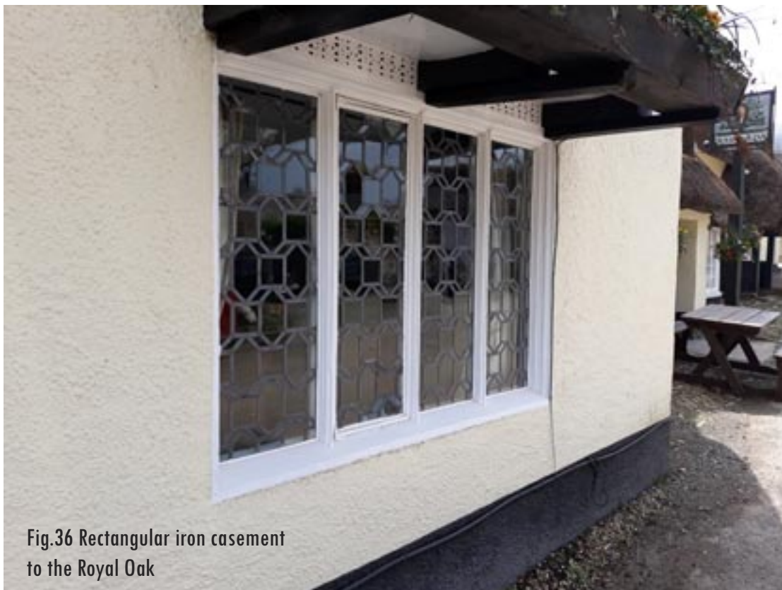
Fig.36 Rectangular iron casement to the Royal Oak

Historic windows in the conservation area are mainly a mixture of timber and metal casements. Although this has long been the traditional local vernacular pattern, there are also good examples of sash windows, for example, the former Vicarage and Karlake House where the pattern is of narrow glazing bars, indicating Georgian or early Victorian origin. A good later 19th century example with fewer glazing bars can be seen at Bevin's Cottage. There are a few examples of forged iron frames, and of decorative glazing patterns, as in the ogee-arch pattern windows at the Tea Room, a "trademark" feature of cottages once part of the Acland estates. Elsewhere, small pane timber or leaded light glazing patterns, mainly plain rectangular are evident, as at the Royal Oak Inn. Interestingly, this pattern is imitated at the former police house. This imitation of earlier patterns is typical of the Arts & Crafts tradition, which flourished from the late 19th century until c.1930