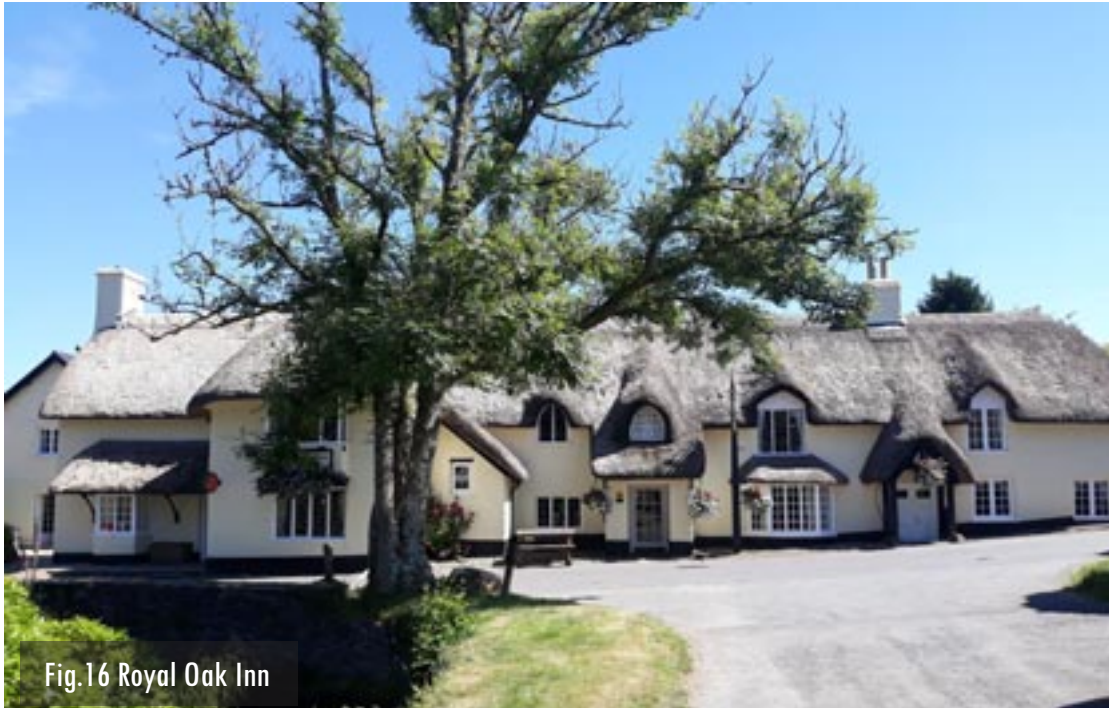
Fig.16 Royal Oak Inn

The Old Rectory is a former farmhouse, originally thought to be known as "Incladons Hay", and thought to date from the 18th century, though with possible medieval origins. It has an early-mid 19th century panelled door, with the top four glazed. There is a 19th century wrought iron entrance gate similar to Royal Oak Cottage. To the south and west are extensive farm outbuildings , including a long barn with two sets of double doors to probable former threshing floors. Facing a yard to the rear is a former cart-shed and a shippon, the latter with round-section stone piers, a typical local vernacular feature, usually of c.18th century date.