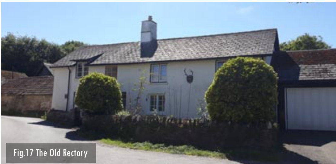
Fig.17 The Old Rectory

The Old Rectory is a former farmhouse, originally thought to be known as "Incladons Hay", and thought to date from the 18th century, though with possible medieval origins. It has an early-mid 19th century panelled door, with the top four glazed. There is a 19th century wrought iron entrance gate similar to Royal Oak Cottage. To the south and west are extensive farm outbuildings , including a long barn with two sets of double doors to probable former threshing floors. Facing a yard to the rear is a former cart-shed and a shippon, the latter with round-section stone piers, a typical local vernacular feature, usually of c.18th century date.