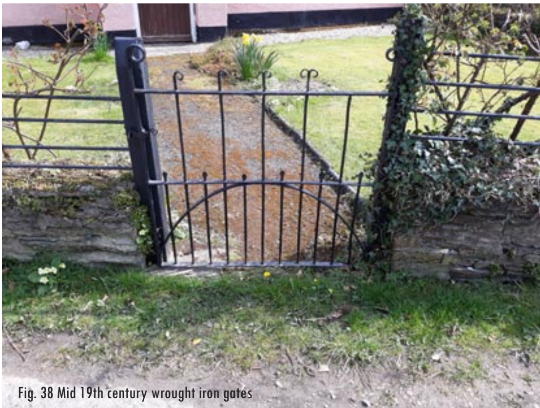
Fig. 38 Mid 19th century wrought iron gates

There are a few good examples of ironwork, most notably wrought iron gates, as at the entrance to the Old Vicarage, and to a number of garden gates, as well as some boundary railings, for example to the north of Karlake House.