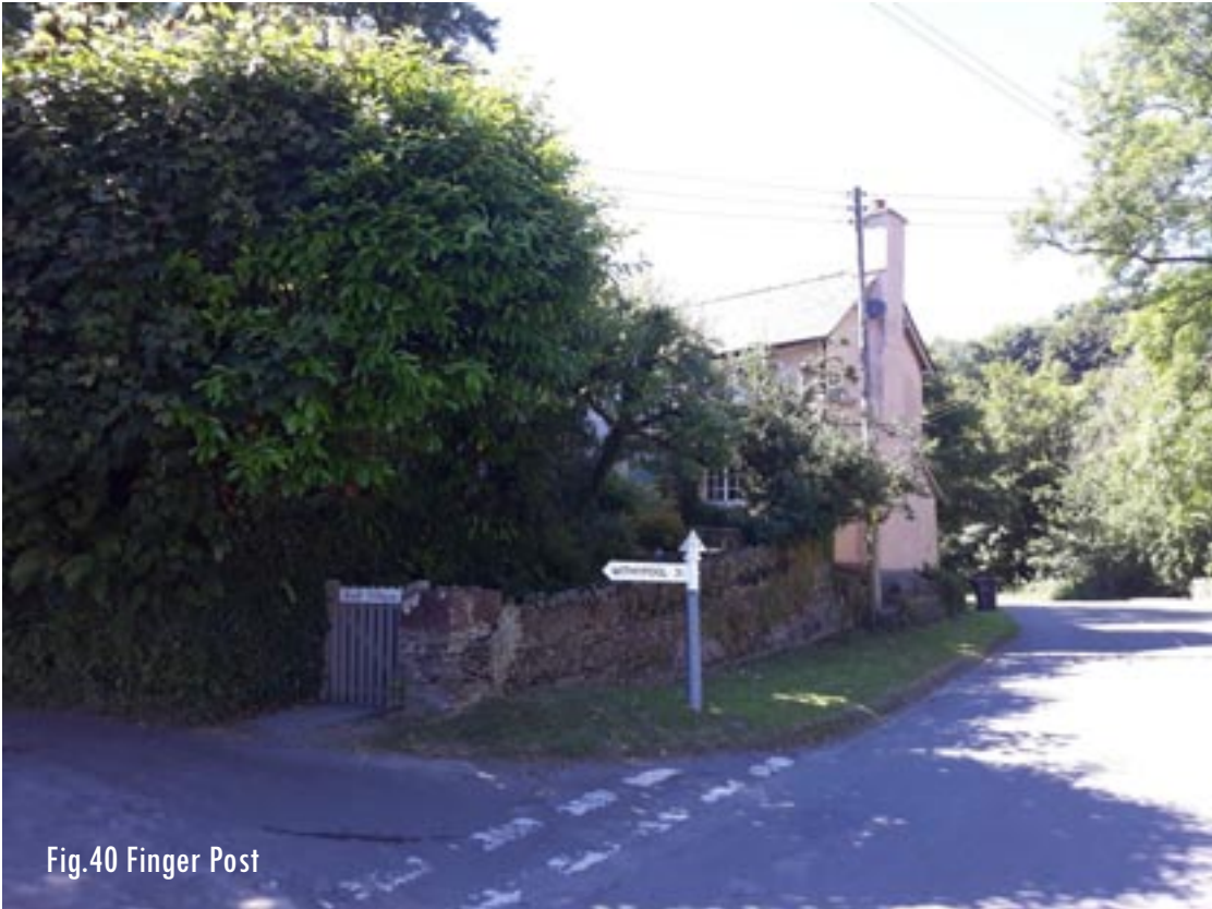
Fig.40 Finger Post