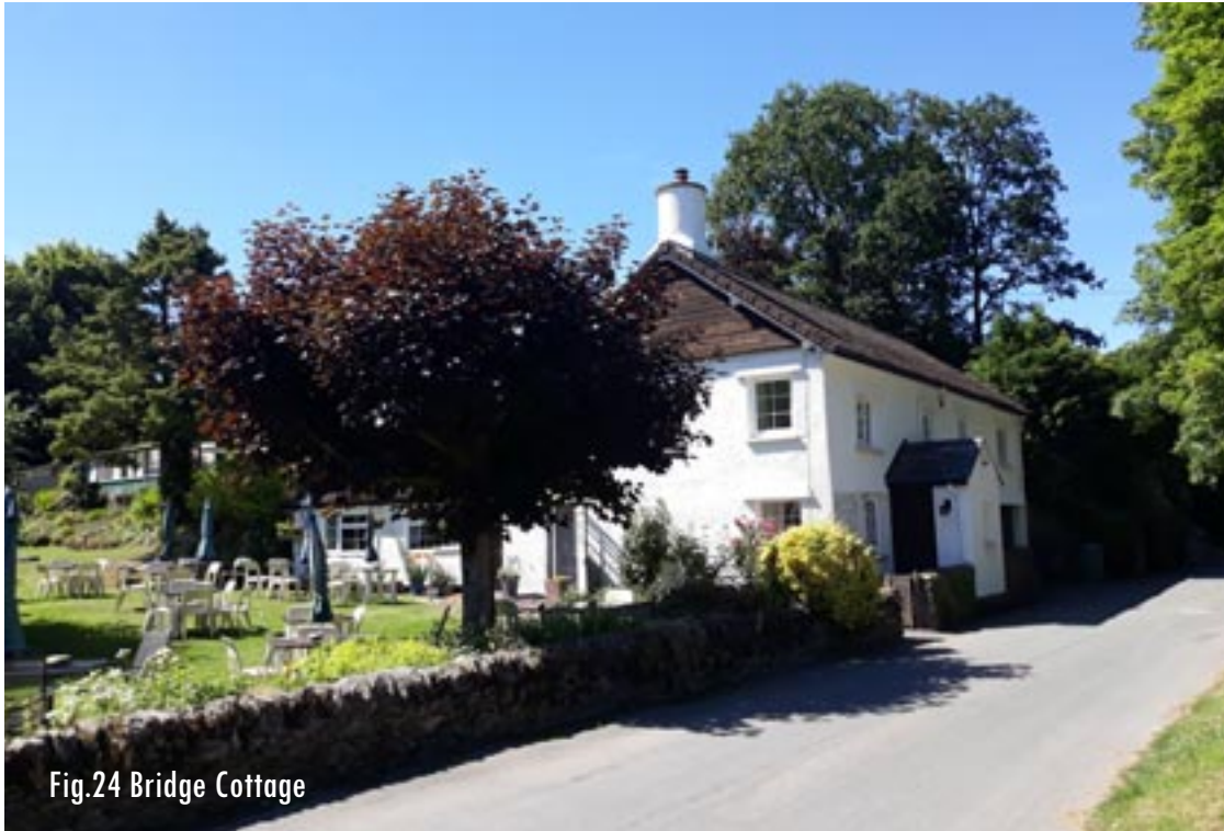
Fig.24 Bridge Cottage

Returning to the village centre, Bridge Cottage , a tea room since c.1950, is thought to date from c.1780. It was originally thatched, and bears the typical Acland estate feature of triple ogee-arched windows with drip-mould above, and round-section stack, probably added in the early-mid 19th century.