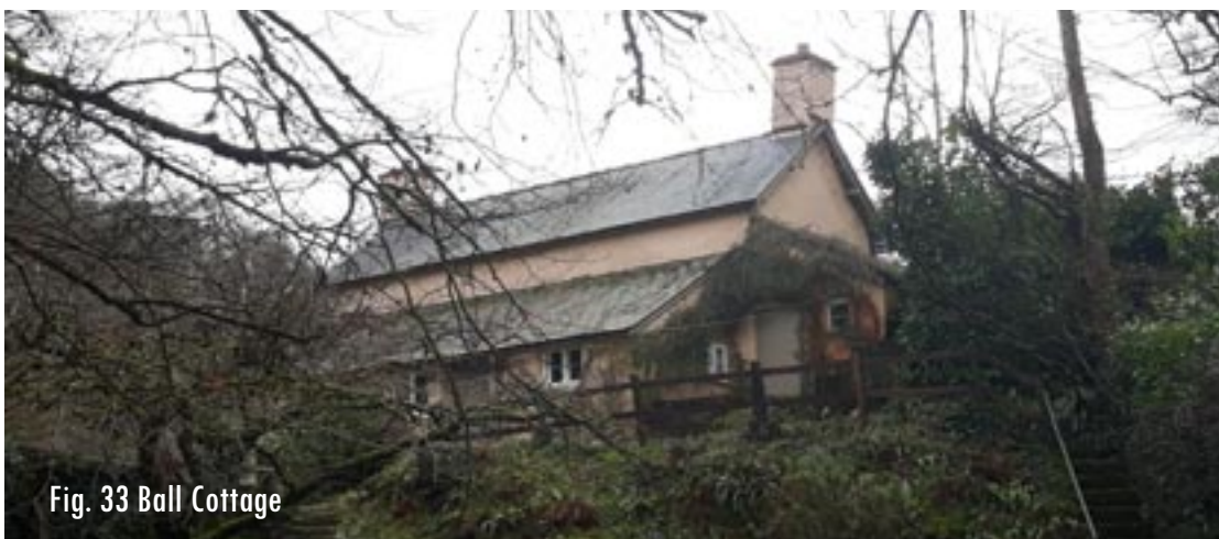
Fig. 33 Ball Cottage

At the northern end of the village, Ball Cottage outwardly of late 18th century or early 19th century date but possibly of earlier origin, is an unspoiled cottage, with plank doors and timber casement windows. Built on a spur of underlying rock with end gable and projecting stack facing the highway, it fully retains original character of colour-washed stone rubble, and slate roofs including the added lean-to rear extension. Also in this part of the village the former Vicarage stables is two storey and stone built with half-hipped slate roof, and is probably contemporary with the early 19th century extension having shallow segmental arched openings and six-pane sash windows. Also at this end of the village, Pitt Cottages rendered with slate roof and brick stacks, have low gabled dormers and timber casement windows, and are probably early 19th century. Beyond is a corrugated iron garage/store.