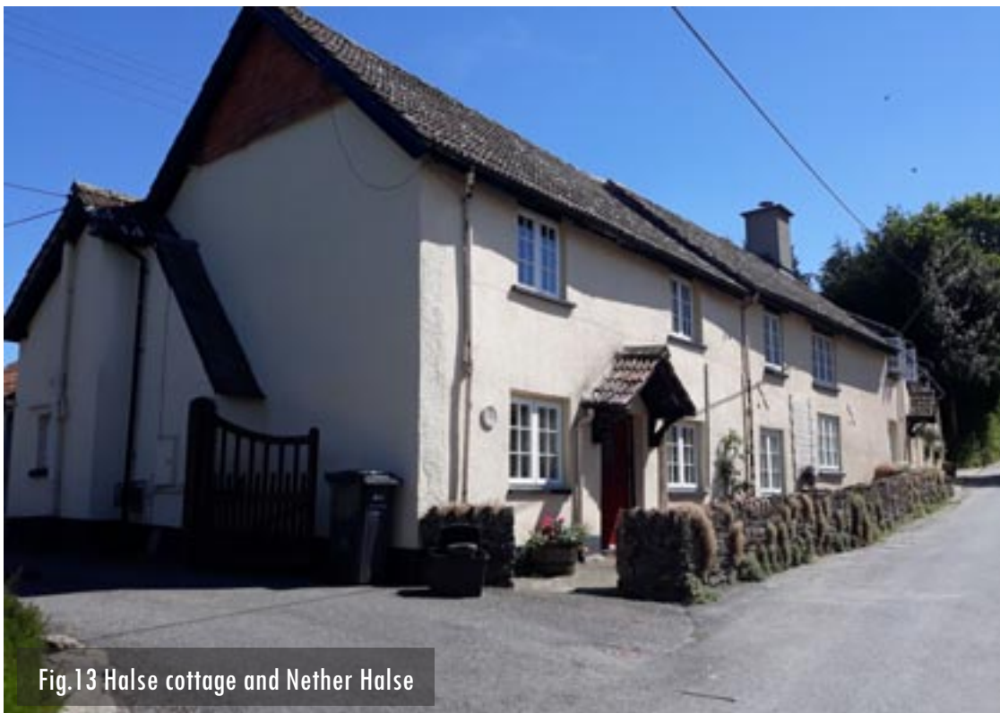
Fig.13 Halse cottage and Nether Halse

On Halse Lane, Halse Cottage and Nether Halse , although not listed, are reputedly quite early. Their long narrow profile, large rendered axial stack and lowered dormers with pent roof (as elsewhere, an indication of former swept thatch eaves), are probably of 17th-18th century origin.