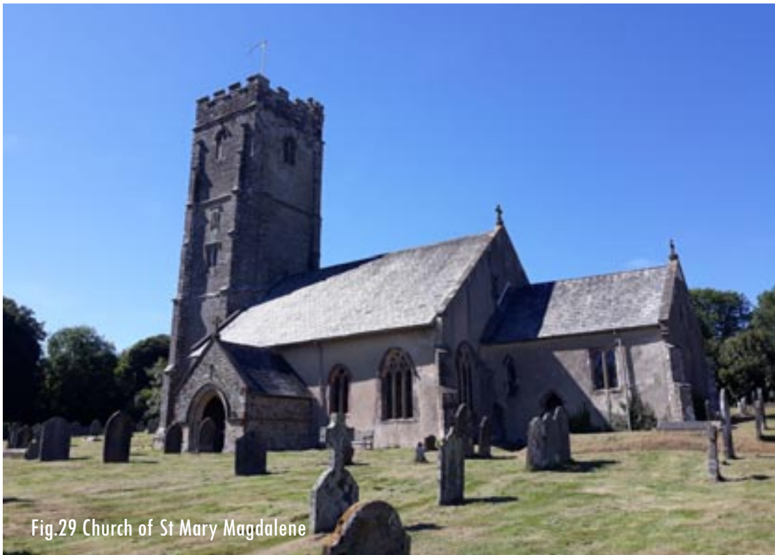
Fig.29 Church of St Mary Magdalene