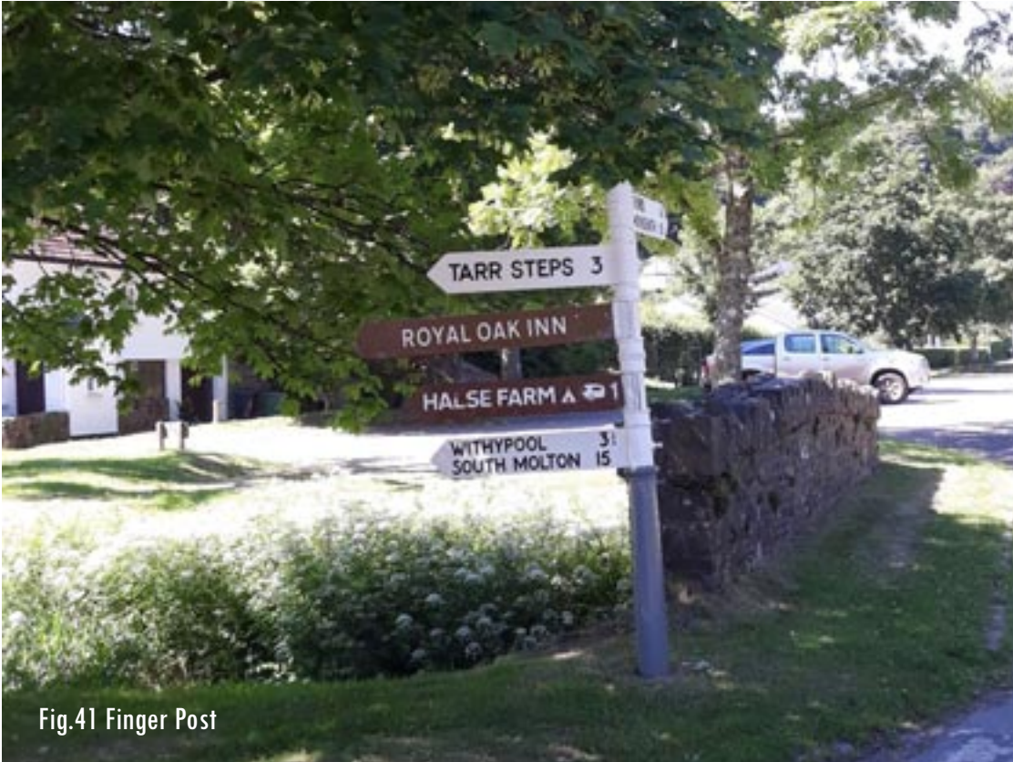
Fig.41 Finger Post