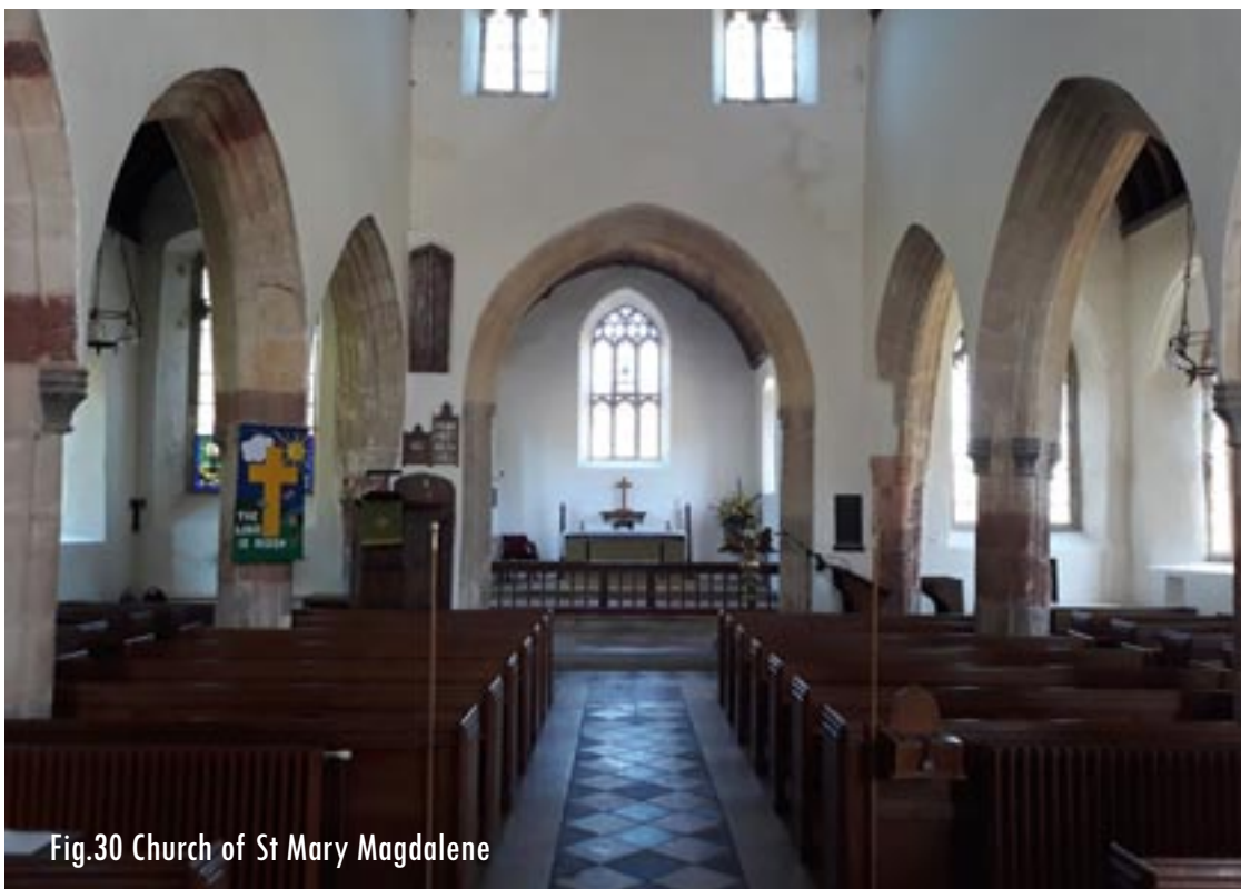
Fig.30 Church of St Mary Magdalene