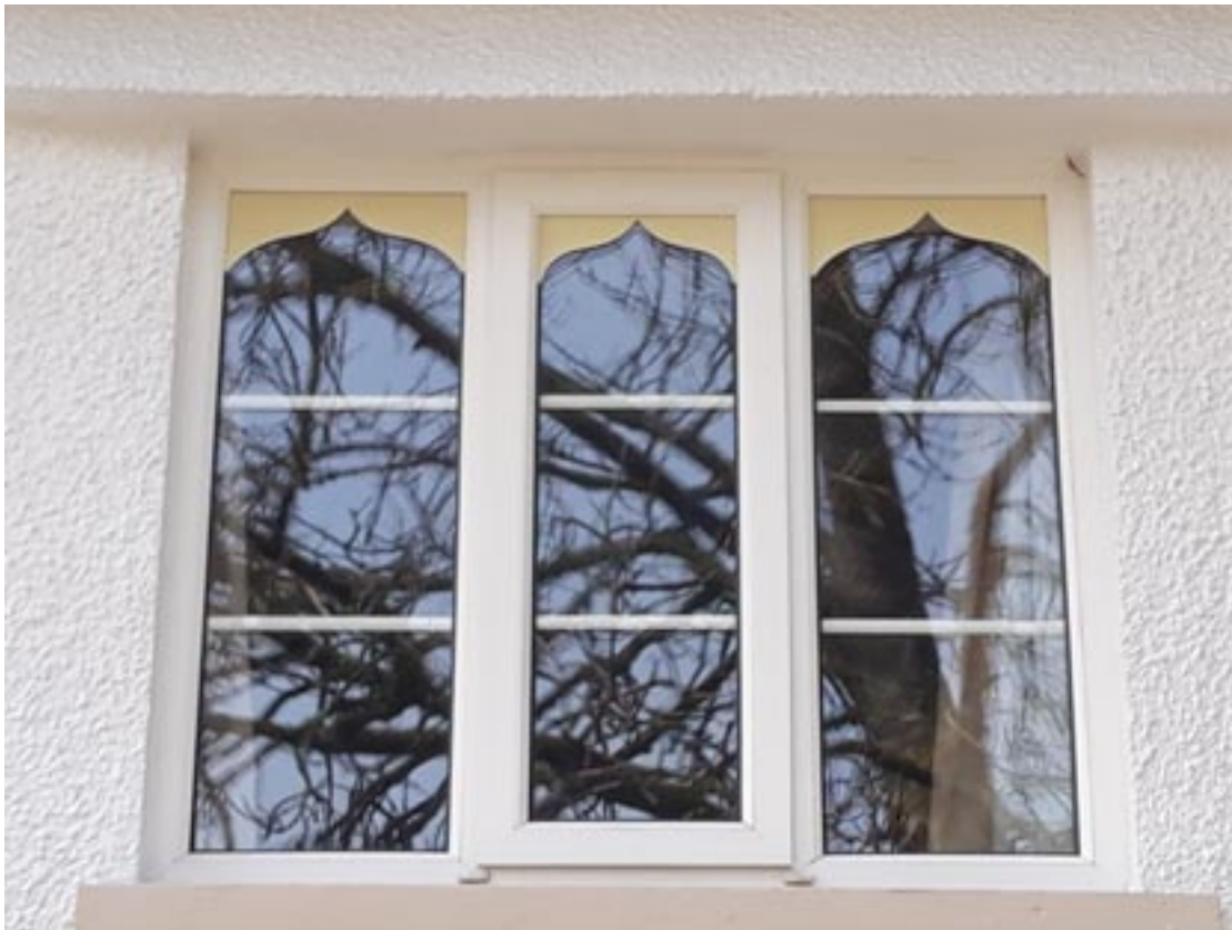
Fig. 46 Plastic windows fitted to the tea-rooms

Most historic buildings, both listed and unlisted, are generally well maintained. Some former farm outbuildings both within or on the borders of the village, although inherently structurally sound, appear to be suffering some neglect or under-use. A large proportion of timber windows and entrance doors survive in their original form, or where replacements have been made, these have tended to closely match the traditional form and still predominate. Even so, PVCu replacement windows and doors are starting to make inroads into the village and are most evident when installed within the close-knit pattern of early development. Such replacements, even where they closely match the traditional glazing and joinery patterns, inevitably introduce an artificial product that in a historic setting can all too easily destroy the visual integrity of even the most modest of traditional buildings.