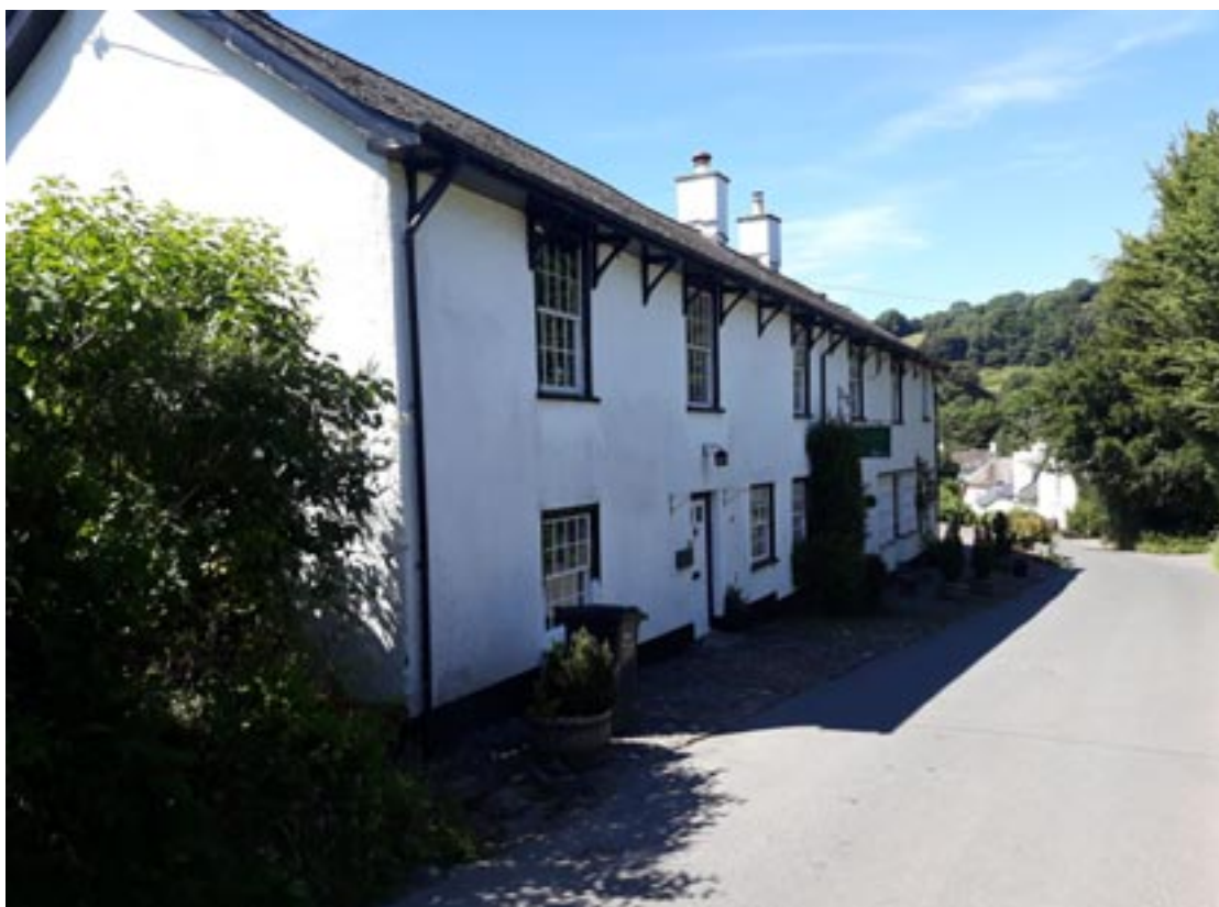
Fig.15 Karlake House has 16th century origins, but most frontage detail is 19th and 20th century, including a former shop-front added in the early 20th century.

Of the most prominent secular buildings, The Royal Oak Inn , has pride of place in the village. Thatched and rendered, it was formerly a farmhouse before becoming an inn, and with annexes to the side and rear is now also a hotel. The original building, probably three-cell and cross-passage, dates from the 16th-17th century, with a cross-wing extension at the second bay to the left. It has been much altered and enlarged since the 19th century and most of the distinctive fenestration, including timber casement windows, some with astragal glazing bars, is 19th-20th century. The projecting cross-wing, dormer window set in adjoining catslide extension, prominent swept eaves and gabled porch, all thatched, contribute to a frontage of exceptionally picturesque character. Pevsner describes the building as having thatch undulating over dormers and of being mostly late Georgian too with an older core