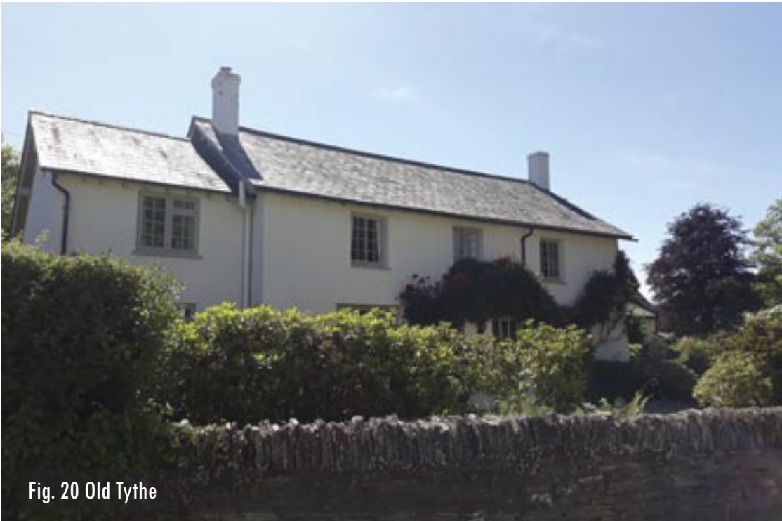
Fig. 20 Old Tythe

Heading south down Edbrooke Road Old Tythe has 8- pane casements with narrow glazing bars was formerly the village bakery, and appears to have 18th century or earlier origins.