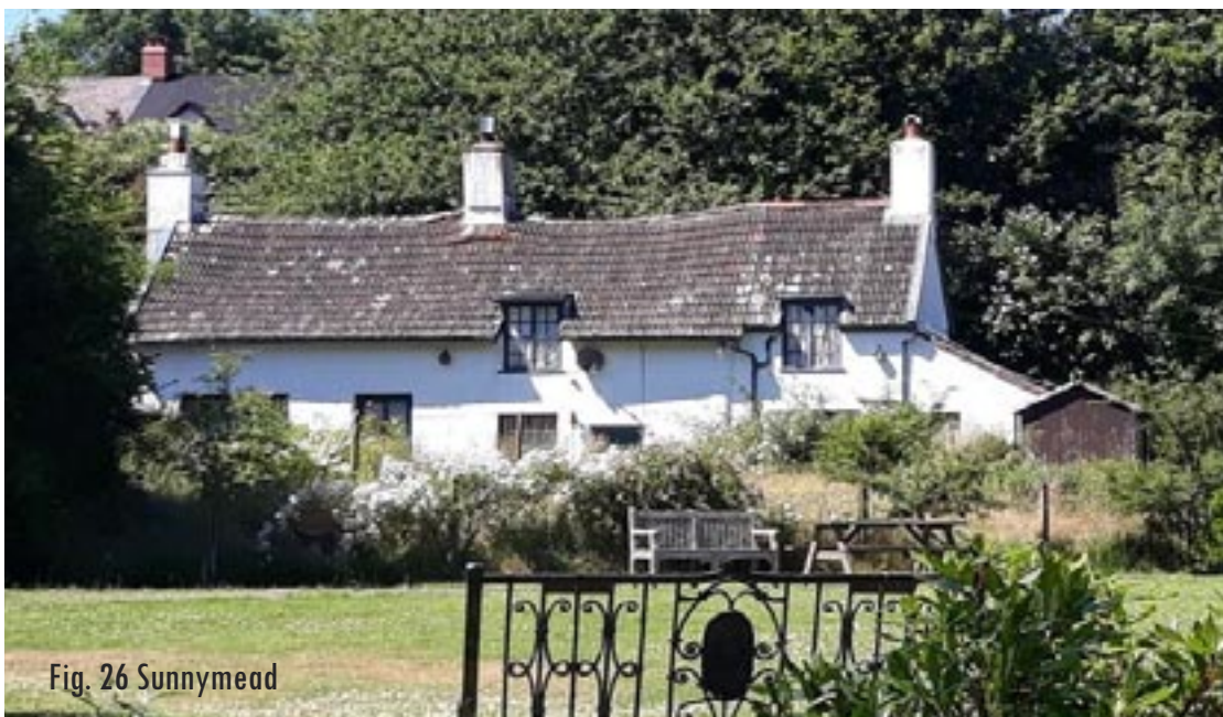
Fig. 26 Sunnymead

Another detached cottage is Sunnymead , originally 17th century but extended and re-fronted in the early 20th century. Probably originally a three cell and cross-passage plan, but since altered internally. Rendered over rubble and possibly some cob, there are three rendered stacks. The below eaves first floor windows indicate a former thatched roof with swept eaves, and there is an early 19th century iron-frame casement window with leaded-lights. The listing details mention that this cottage is "principally listed for its contribution to the picturesque village scene, overlooking village green."