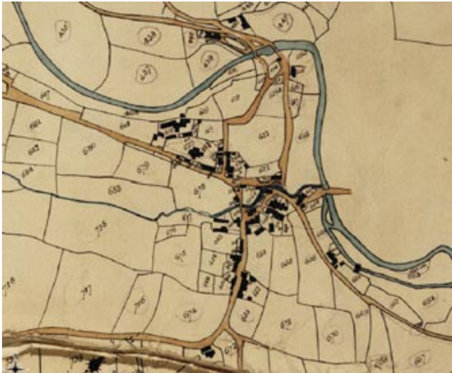
Fig.1 Extract of Tithe Apportionment Map of c.1839.

Post war development has generally occurred along radial routes that converge on the village centre with some infill. The most significant recent development was the construction of six affordable home at Darby's Knap in the 1990s, on the edge of the village adjacent to Edbrooke Road. Two further local affordable homes have been provided along Ash Lane.