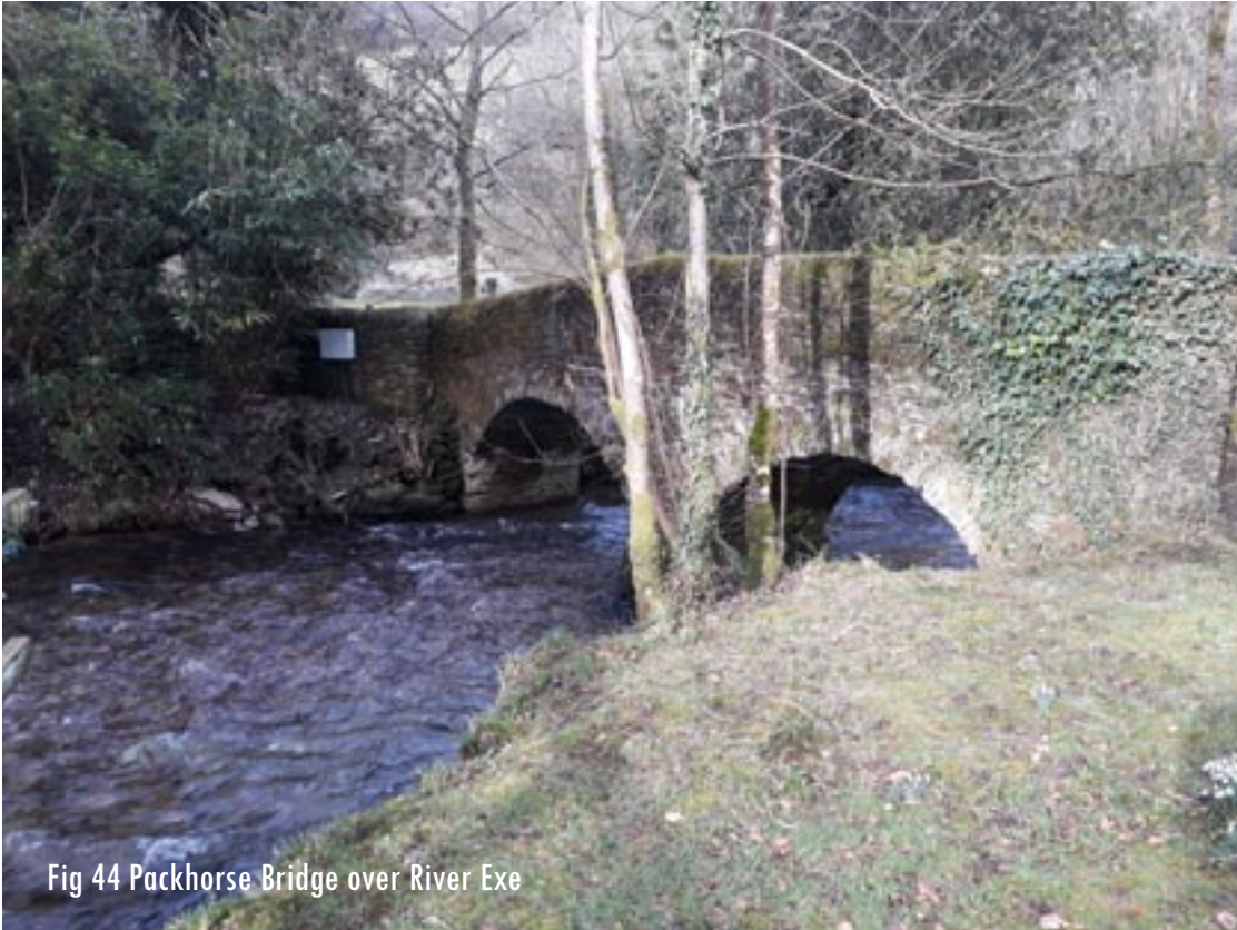
Fig 44 Packhorse Bridge over River Exe