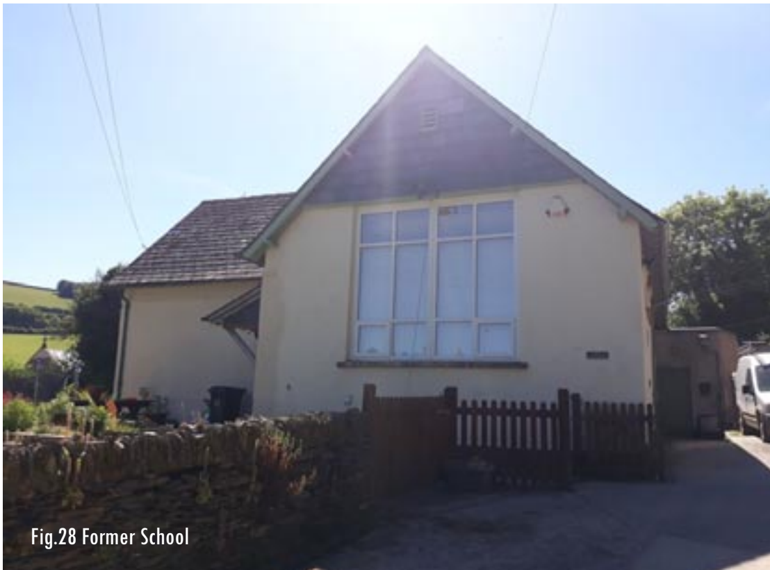
Fig.28 Former School

The school was attended by The Rt Hon Ernest Bevin, wartime Minister of Labour, British Foreign Secretary 1945-1951, architect of NATO and world statesman. He entered on 26 May 1884 and left in 1889. It was also attended by Boris Johnson MP who served as Foreign Secretary from 2016-2018 making it the only primary school in the country to produce two Foreign Secretaries