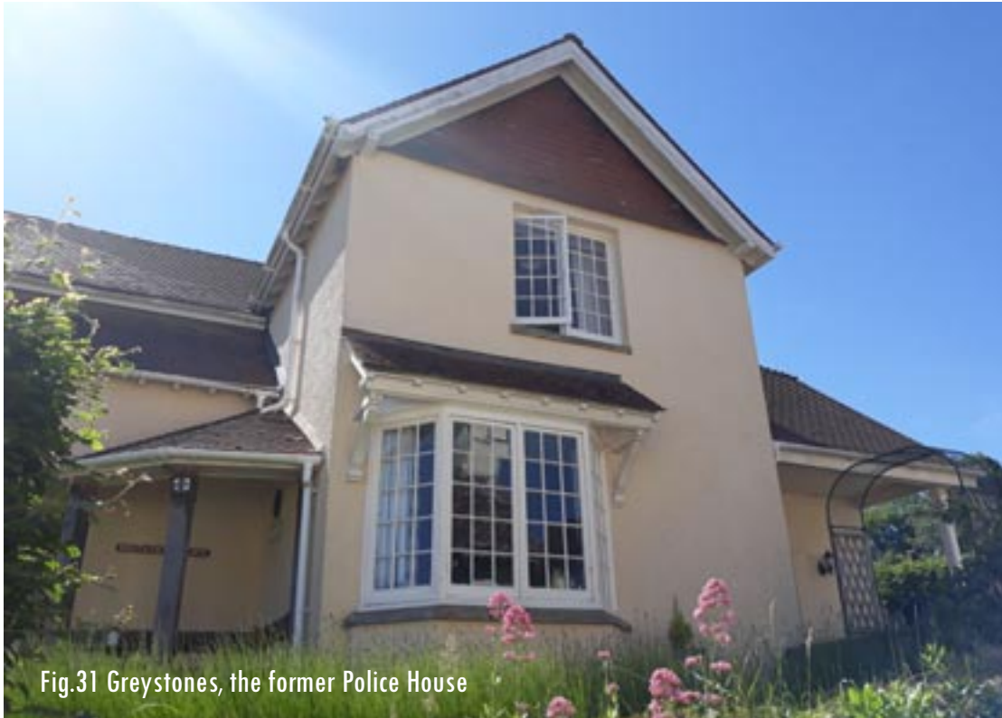
Fig.31 Greystones, the former Police House

The former Police House (now Greystones) contains small pane timber windows that imitate those found in the Royal Oak. The elevations were formally slate hung as a reference to other Exmoor buildings but this has now unfortunately been removed. Winsford had a village policeman until after the Second World War. The Police Station was moved from Pitt Cottage to Greystones in the 1930s.