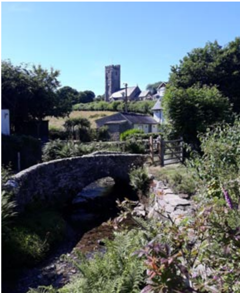
Fig.12 View from the green to the Church