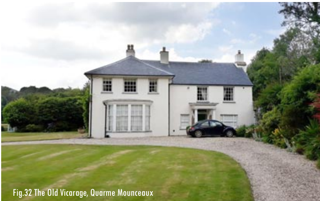
Fig.32 The Old Vicarage, Quarme Mounceaux

At the northern end of the village, Ball Cottage outwardly of late 18th century or early 19th century date but possibly of earlier origin, is an unspoiled cottage, with plank doors and timber casement windows. Built on a spur of underlying rock with end gable and projecting stack facing the highway, it fully retains original character of colour-washed stone rubble, and slate roofs including the added lean-to rear extension. Also in this part of the village the former Vicarage stables is two storey and stone built with half-hipped slate roof, and is probably contemporary with the early 19th century extension having shallow segmental arched openings and six-pane sash windows. Also at this end of the village, Pitt Cottages rendered with slate roof and brick stacks, have low gabled dormers and timber casement windows, and are probably early 19th century. Beyond is a corrugated iron garage/store.