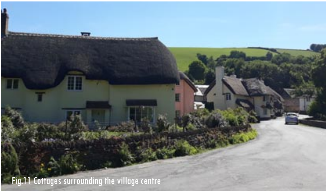
Fig.11 Cottages surrounding the village centre