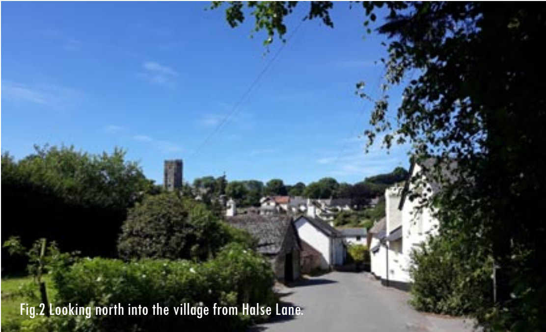
Fig.2 Looking north into the village from Halse Lane.