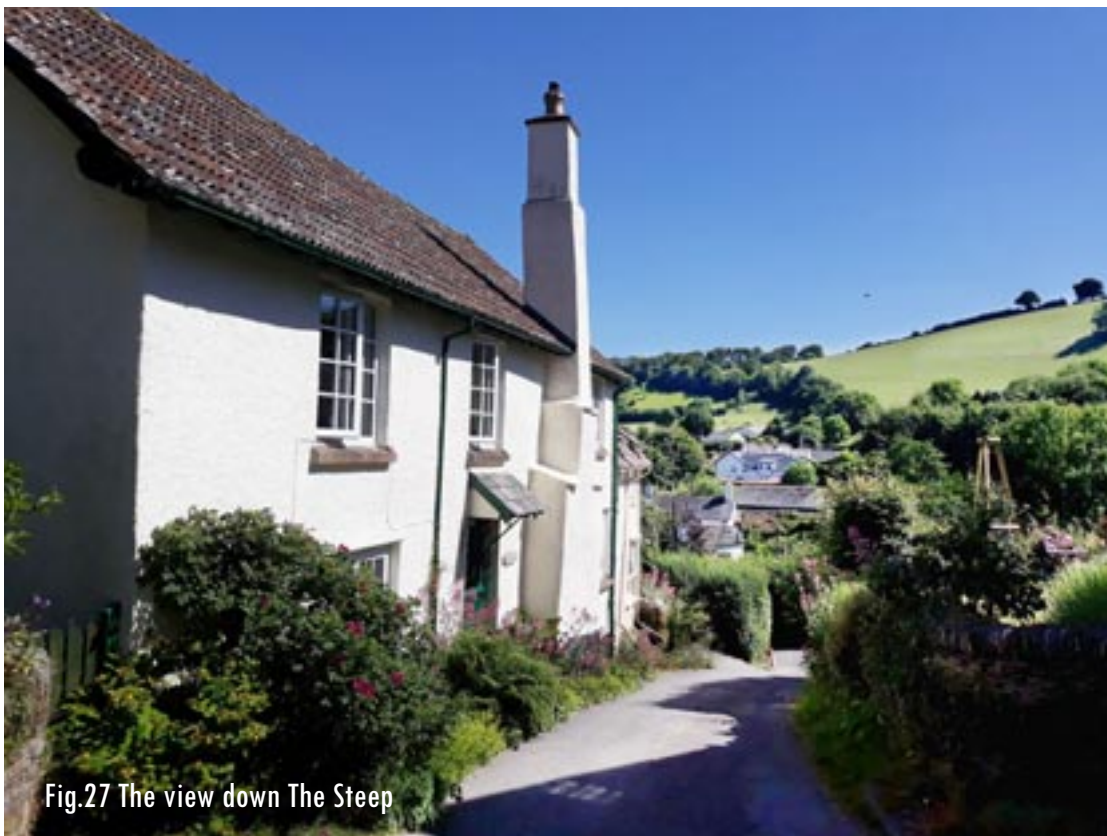
Fig.27 The view down The Steep

A compact group to the east of the church consists of Church Cottage , Gallifords , Steep Cottage and Gay's Cottage . Each retains some vernacular features, indicating an 18th century or earlier date, for example shouldered front lateral or gable end stacks with square-section rendered uppers and six-panel door with steps up at Church Cottage. The plain timber casement windows, some small paned and plank doors are probably of 19th century origin.