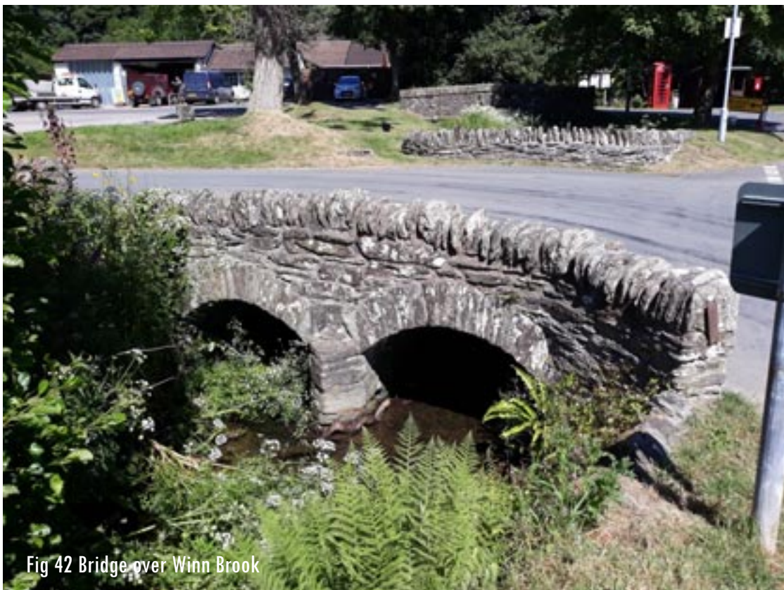
Fig 42 Bridge over Winn Brook

The streams flowing through the Winsford contribute greatly to its character and appearance. Winsford has a number of bridges of different dates and constructions including two stone footbridges both restored in 1952. The Packhorse Bridge crossing the River Exe , a Scheduled Ancient Monument and Grade II* listed, is medieval in origin and has a two-arch span with random-rubble voussoirs and small cut water on upstream side. It is mainly built of flat-bedded slate, vertically aligned as coping and was restored in 1952. In the village centre is another Packhorse Bridge crossing the River Winn of similar date and also an Ancient Monument, but much smaller and lower with shallow arched single span, mainly of red sandstone rubble with end-on bedded coping, and some dressed stone to abutment and voussoir. The Old Winn Bridge , Grade II Listed, was the only road crossing in the village centre prior to the 1920s. The road bridge across the River Exe, known as Vicarage Bridge . It is recorded as originally built in 1835, although appears older, and was widened in 1928.