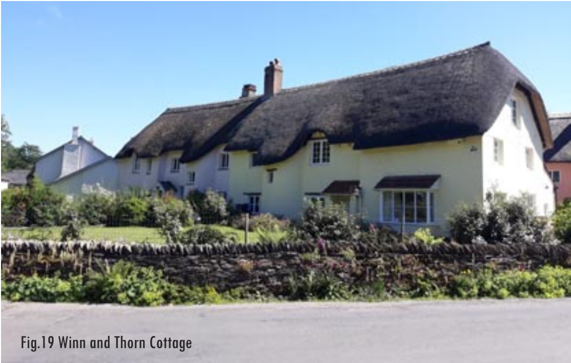
Fig.19 Winn and Thorn Cottage

Heading south down Edbrooke Road Old Tythe has 8- pane casements with narrow glazing bars was formerly the village bakery, and appears to have 18th century or earlier origins.