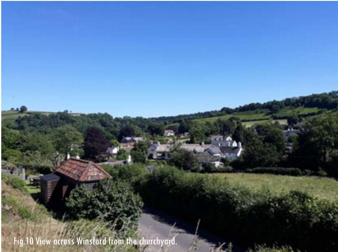
Fig.10 View across Winsford from the churchyard.

Winsford is a picturesque village surrounded by attractive farm and moorland, Views in and out of the Conservation Area form an essential part of its character and are one of its chief delights. The high ground from the Halse Lane approach (outside of the proposed Conservation Area) offers excellent views west into the village. There a similar long view into the village from the north west near the top of Ash Lane and from the churchyard.