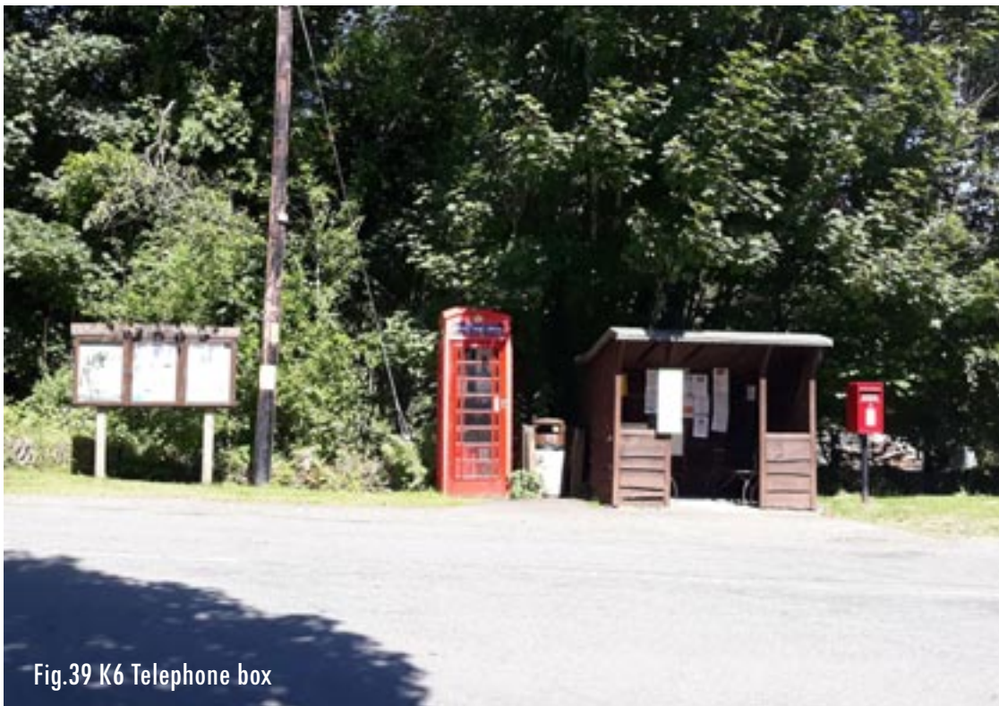
Fig.39 K6 Telephone box

There is a mid 20th century cast iron Somerset County Council guidepost adjacent to the Old Winn Bridge and a second near Ball Cottage both of which have recently been refurbished.