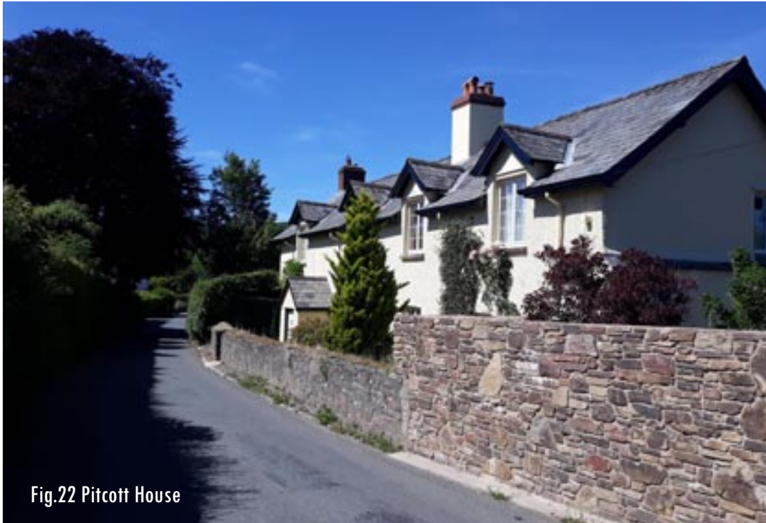
Fig.22 Pitcott House

The group consisting of Post Office Stores and Jasmine Cottage date from the 19th century. The latter is recorded as built in 1866 on Sir Thomas Dyke Acland's land by Joseph Steer a local building contractor who set up the adjoining carpenters' workshop, now called The Old Timber Store. Weirside was formally a Methodist chapel but was poorly converted in the 1980s, little evidence of its former use or appearance remains.