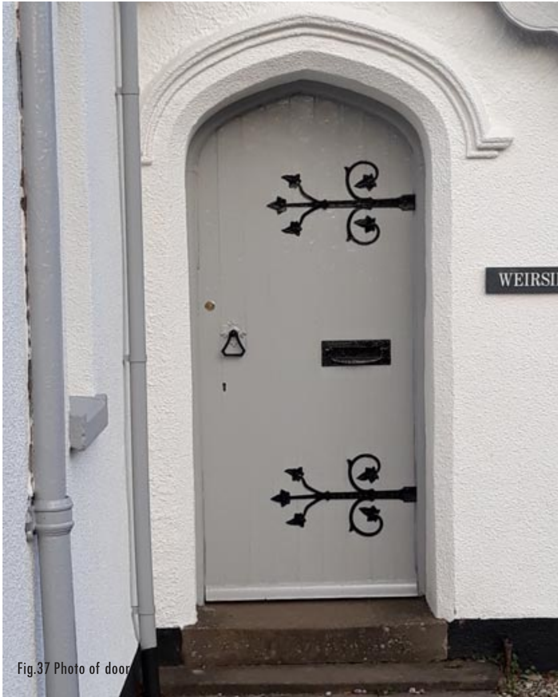
Fig.37 Photo of door

Many doors are constructed in a traditional plank and ledged form, some incorporating fixed lights. In some of the grander domestic buildings these are panelled, some with glazed panels or with over-lights. There is little obvious ornament, but a number of cottages have small front porches with gabled roofs and a variety of sometimes ornamental detail, mainly dating from the 19th century.