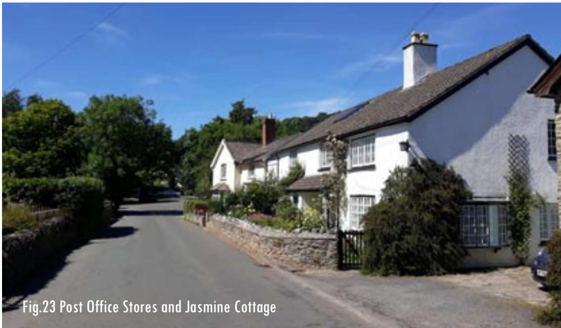
Fig.23 Post Office Stores and Jasmine Cottage

The group consisting of Post Office Stores and Jasmine Cottage date from the 19th century. The latter is recorded as built in 1866 on Sir Thomas Dyke Acland's land by Joseph Steer a local building contractor who set up the adjoining carpenters' workshop, now called The Old Timber Store. Weirside was formally a Methodist chapel but was poorly converted in the 1980s, little evidence of its former use or appearance remains.