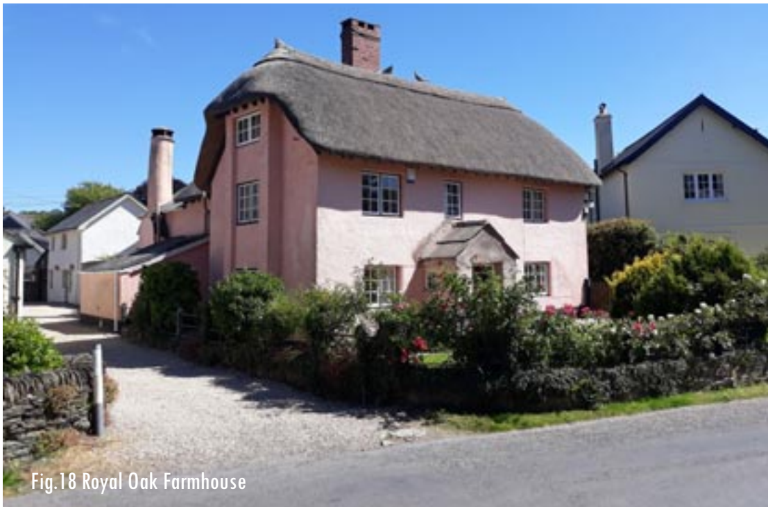
Fig.18 Royal Oak Farmhouse

Close by and much plainer is the Royal Oak Farmhouse , also thatched and rendered and dating from the 16th-17th century and now a dwelling. Originally of two-cell and cross-passage plan on an east-west axis, a further two-cell and cross-passage addition was added at the west end. This has half-hipped gables giving light to attic level. The tall central lateral stack to the rear of the added west frontage appears typical of the 17th century. It was re-fronted in the 19th century with a gabled porch likely added at this time.