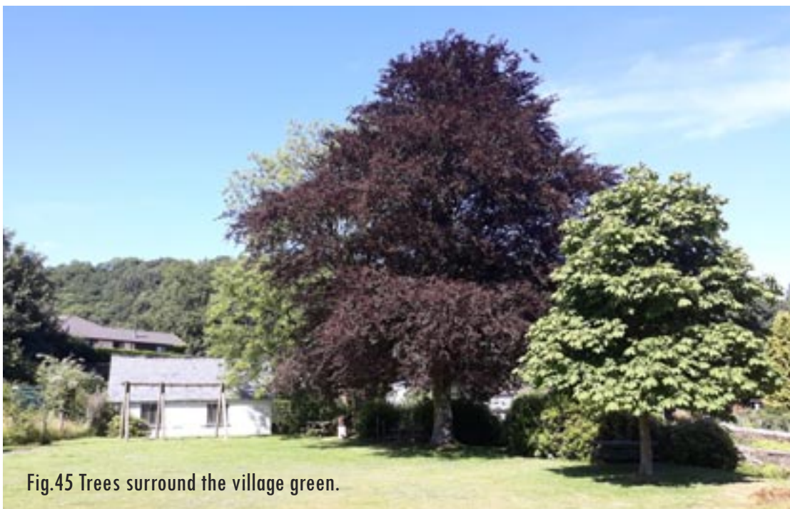
Fig.45 Trees surround the village green.

The strong sense of enclosure the wider landscape provides is further enhanced, especially on the approaches to the village by hedgerow banks, sometimes in deep cuttings known locally as "holloways."