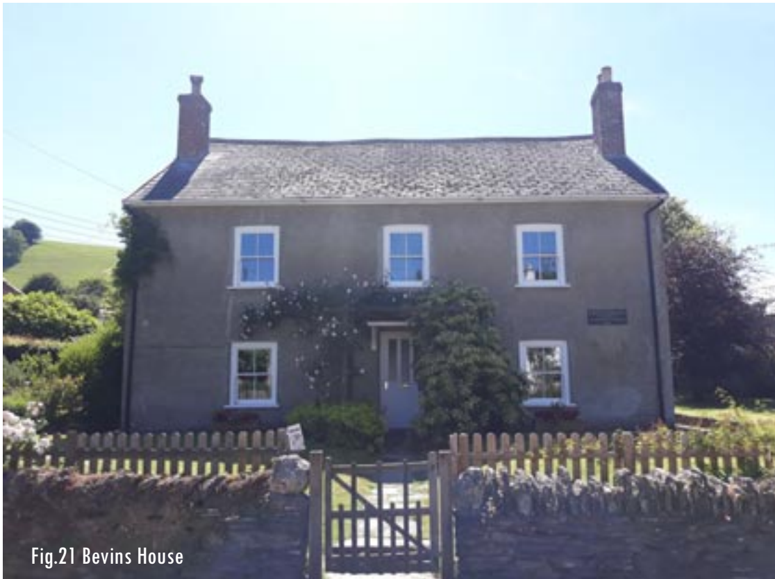
Fig.21 Bevins House

Of particular historic importance is Bevins Cottage with a late 19th century frontage, probably originally a two-cell cottage with cross-passage but with the roof raised subsequently. The three-bay frontage has sash windows with single vertical glazing bar, central half-glazed door with two lights. This was the birthplace and home for his first eight years of Ernest Bevin 1881-1951, statesman and trades union leader who also attended the village school.