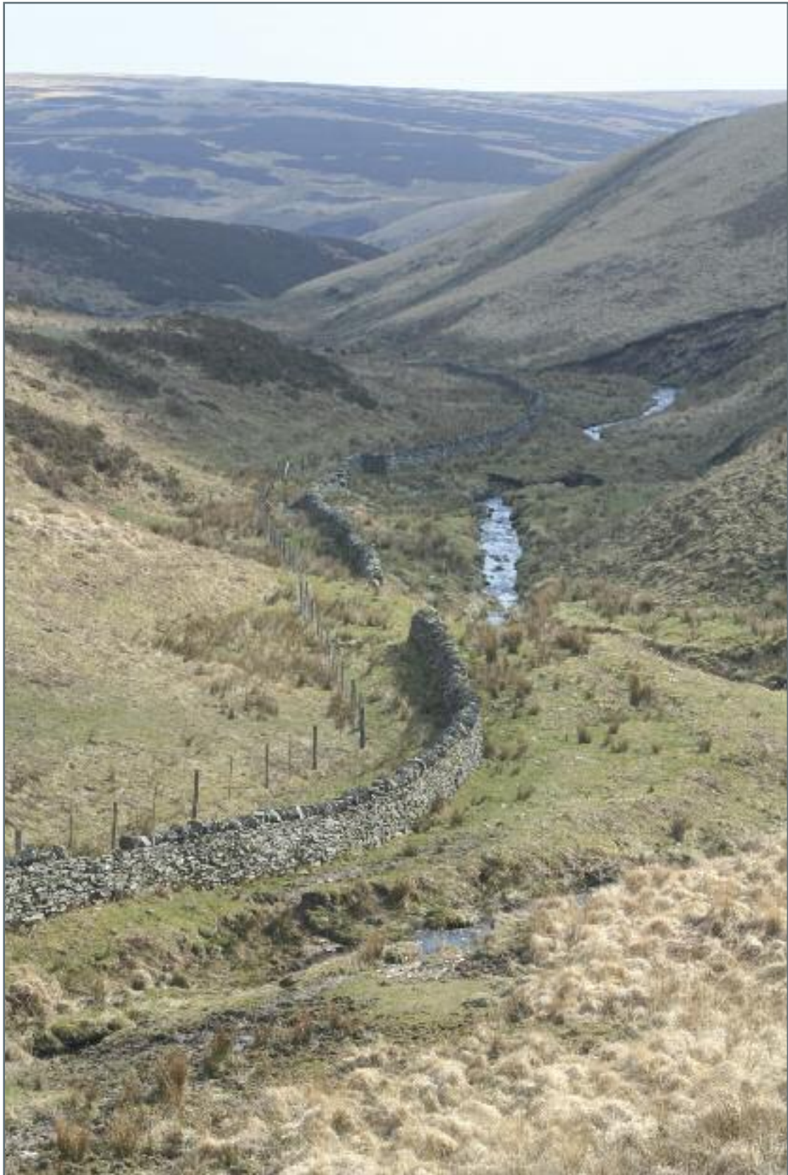
Areas of the Royal Forest boundary are built of dry stone wall in varying condition