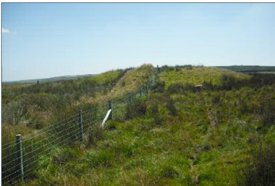
Prehistoric barrows were used as boundary markers in the original perambulations of the Forest. Setta Barrow (pictured here) is notable for the earth bank boundary constructed over the middle.