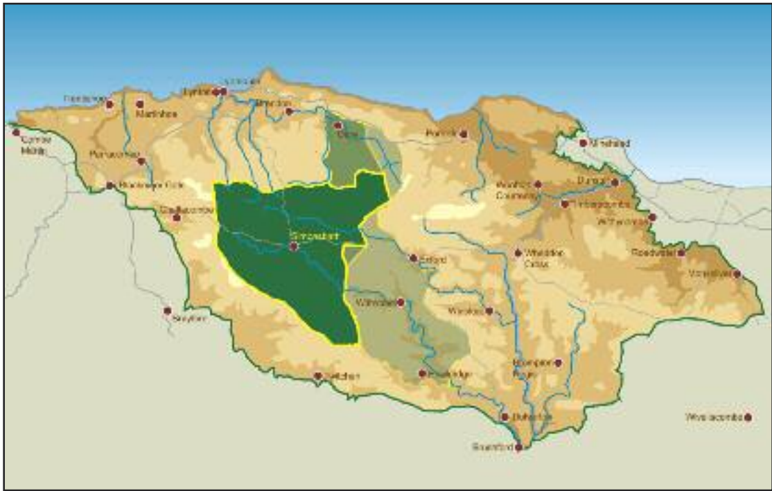
Figure 1: The extent of the Royal Forest of Exmoor between 1400 and 1819, also showing its earlier extents (copyright John Hodgson)

This report is based upon fieldwork carried out along the length of the boundary of the former Royal Forest of Exmoor, to assess the form of the boundary as it exists today. It also draws upon evidence from documentary sources referenced in the Exmoor National Park Historic Environment Record. The findings of this report suggest that the Royal Forest of Exmoor has never been enclosed by a continuous boundary wall, but has utilised a range of natural features and boundary stones. In the post-medieval period it appears that attempts to formalise the boundary with a stone wall or earth bank have been successful along some stretches but did not extend along the entirety of the boundary. This report makes brief assessments of the condition of each section of boundary, with recommendations for areas where future conservation work may be targeted.