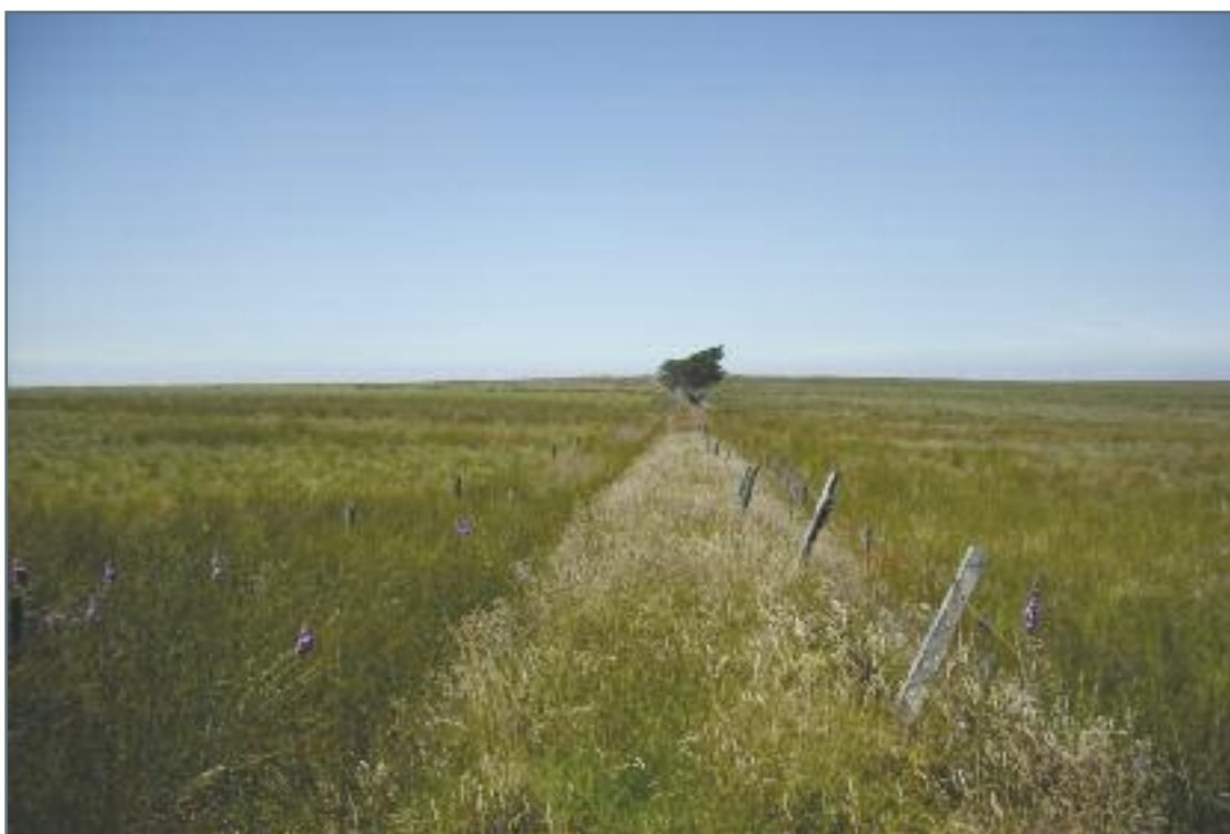
Significant areas of the Royal Forest boundary are formed of earth bank, sometimes with a beech hedge.