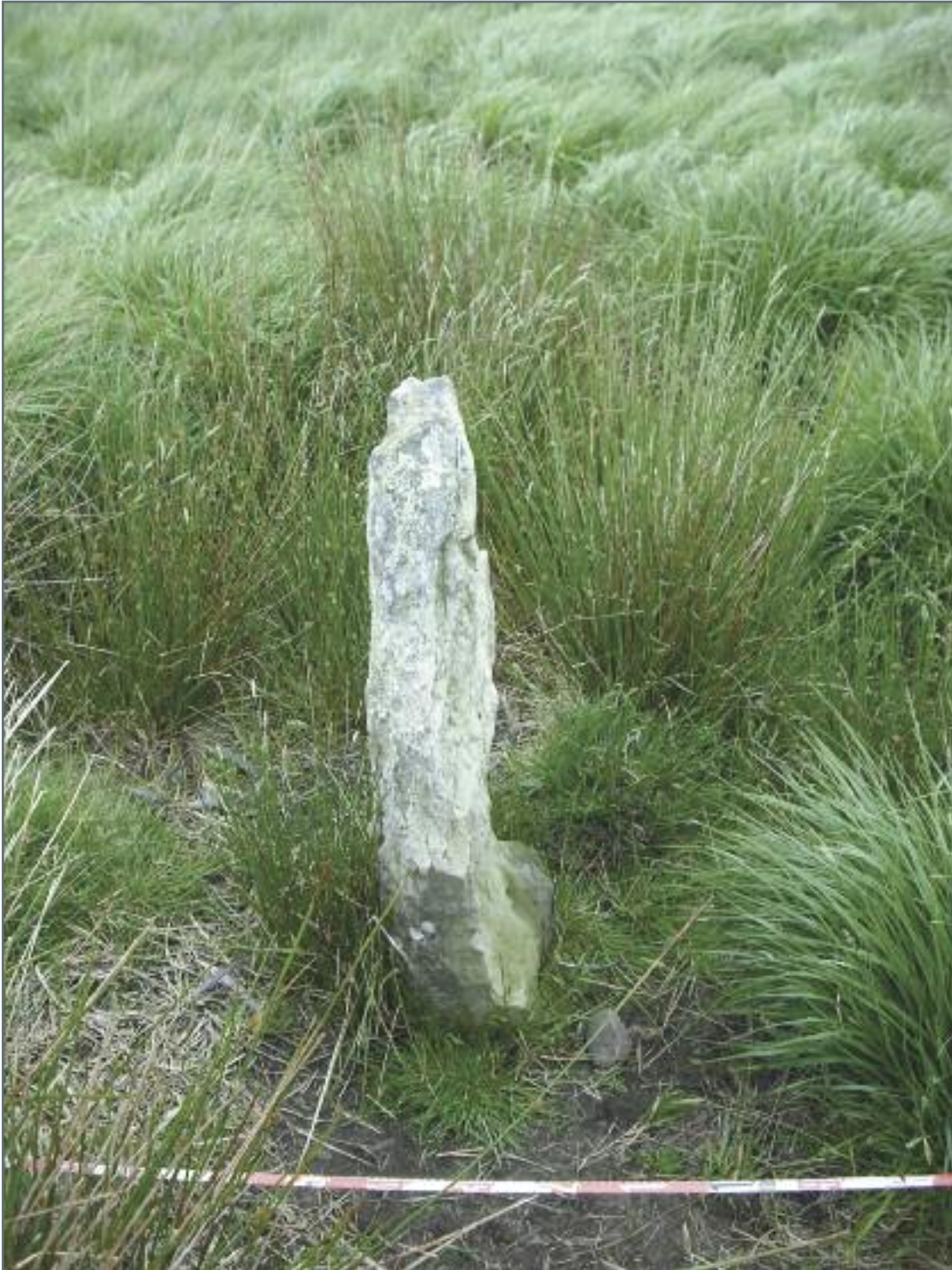
Boundary stones still mark part of the Royal Forest boundary. It is likely that there were many more of these stones marking the medieval boundary of the Forest.