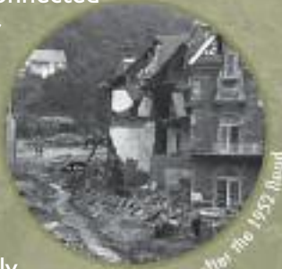
Lynmouth after the 1952 flood

Funded by South West Water, the Exmoor Mires Project has been restoring these areas and undertaking research on how healthy bogs can help to support healthy, clean and safer rivers.