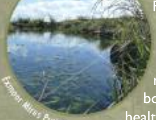
Exmoor Mires Project

There is now an increased appreciation of the role that bogs and mires in the upper catchment of rivers can play in storing water and regulating river flows.