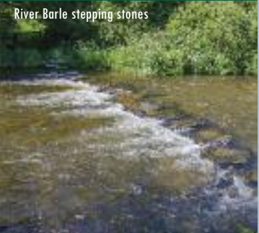
River Barle stepping stones