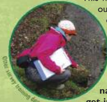
Key training day

This work is vital to increase our understanding of the ecology and health of our rivers and streams and is a great way to really get to know them.