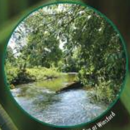
River Exe at Winford

These beautiful rivers are important and sensitive habitats that support a wide range of wildlife, most are privately-owned and managed.